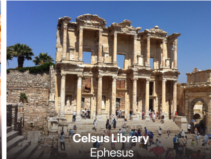
Celsus Library Ephesus

then explore the Grotto of the Apocalypse, where St. John wrote the “Book of Revelation.” You’ll also see the crack made by the divine voice of God. Enjoy dinner and an overnight stay on board the ship, surrounded by the stunning sea.